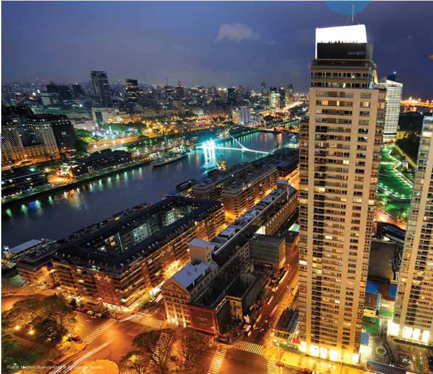
Puerto Madero, Buenos Aires